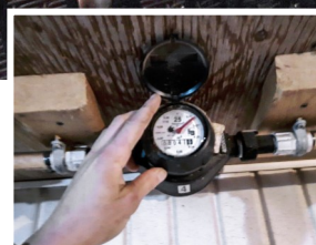
Water bowl and usage meter.

prompted the farm to continue using the water bowls after the project.